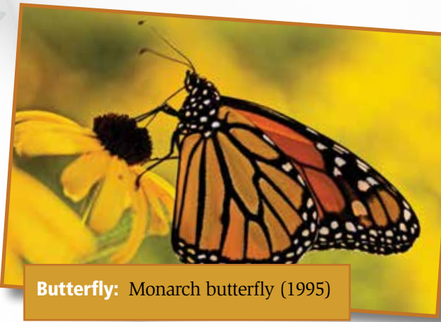
Butterfly: Monarch butterfly (1995)