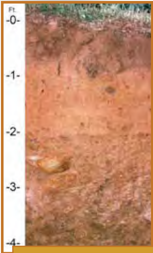
Soil: Monongahela silt loam (1997)