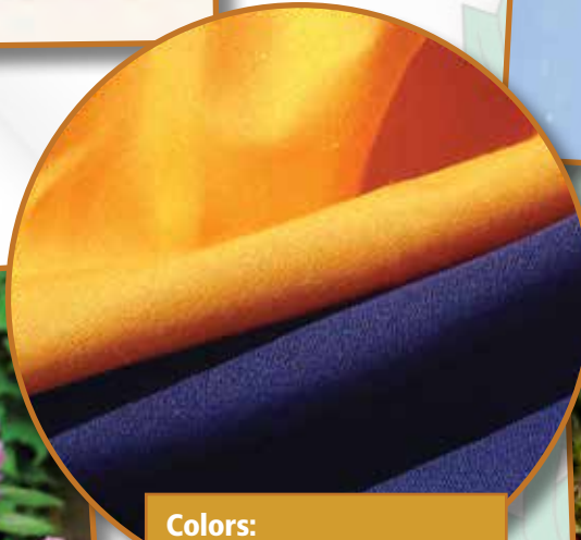
Colors: Old gold and blue (1963)