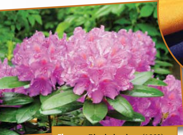
Flower: Rhododendron (1903)