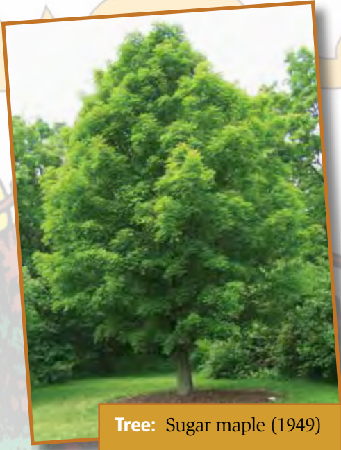
Tree: Sugar maple (1949)