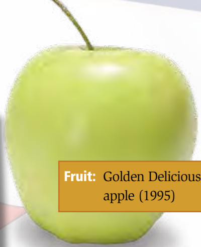
Fruit: Golden Delicious apple (1995)