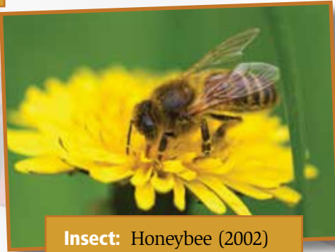
Insect: Honeybee (2002)