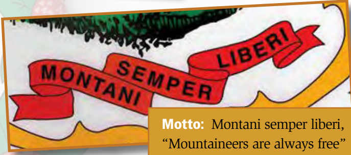
Motto: Montani semper liberi, "Mountaineers are always free"