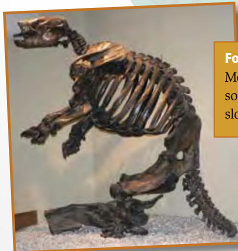
Fossil: Megalonyx Jeffersonii (giant ground sloth) (2008)