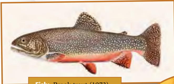
Fish: Brook trout (1973)