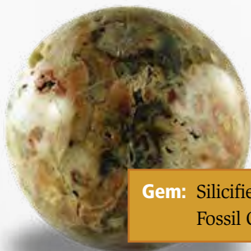
Gem: Silicified Mississippian Fossil Coral (1990)