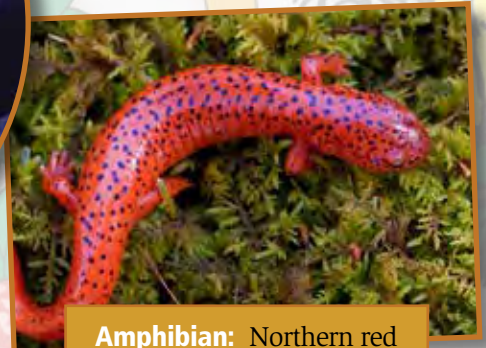
Amphibian: Northern red salamander (2015)