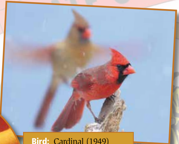
Bird: Cardinal (1949)