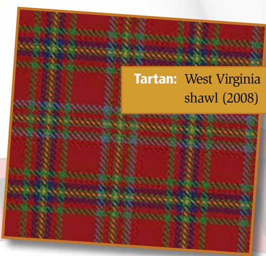
Tartan: West Virginia shawl (2008)