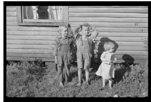
Children of coal miners, Sunbeam Mines, Scotts Run, West Virginia, 1935.