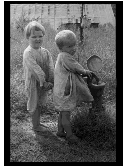
Children of North Carolina sharecropper, 1935.