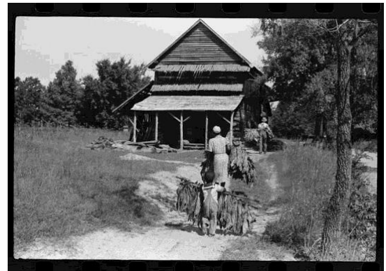
Moving tobacco sticks to barn, Orange County, NC.