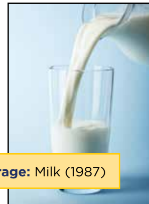
Beverage: Milk (1987)