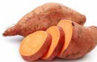
Vegetable: Sweet potato (1995)