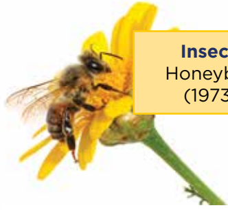
Insect: Honeybee (1973)