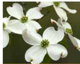
Flower: Dogwood (1941)