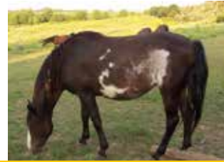
Horse: Colonial Spanish mustang (2010)