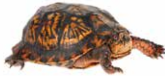
Reptile: Eastern box turtle (1979)