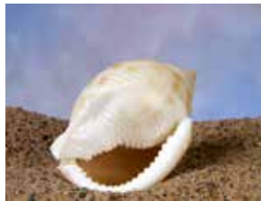
Shell: Scotch bonnet (1965)