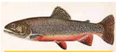
Freshwater trout: Southern Appalachian brook trout (2005)