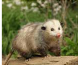
Marsupial: Virginia opossum (2013)