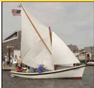
Boat: Shad boat (1987)