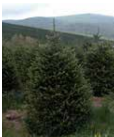
Christmas tree: Fraser fir (2005)