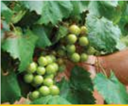
Fruit: Scuppernong grape (2001)