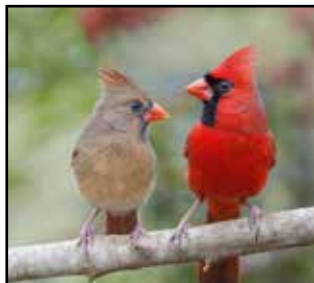
Bird: Cardinal (1943)