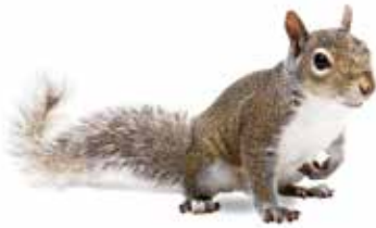
Mammal: Gray squirrel (1969)