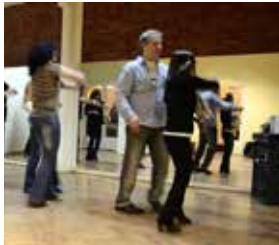
Popular dance: The Shag (2005)