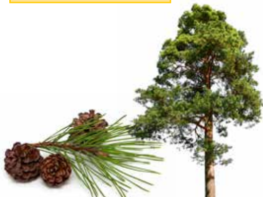
Tree: Pine (1963)