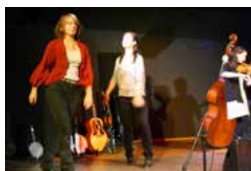
Folk dance: Clogging (2005)