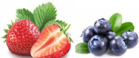
Berries: Strawberry (red berry) (2001) Blueberry (blue berry) (2001)