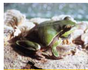
Frog: Pine Barrens tree frog (2013)