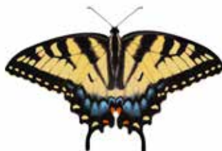
Butterfly: Eastern tiger swallowtail (2012)