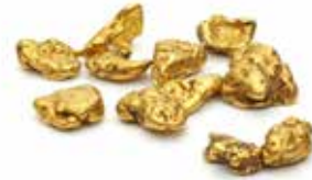
Mineral: Gold (2011)