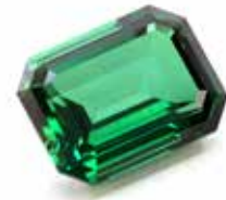
Stone: Emerald (1973)