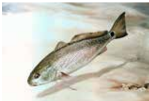
Saltwater fish: Channel bass (1971)