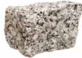
Rock: Granite (1979)