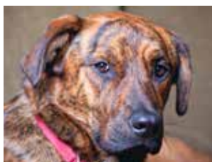
Dog: Plott hound (1989)