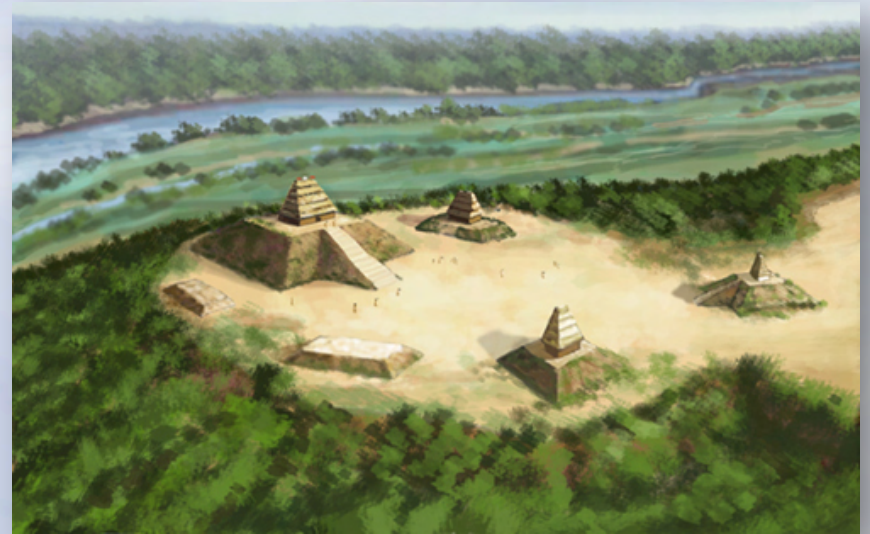
The Anna Site is located in Adams County. Construction began on the mounds around 1200.