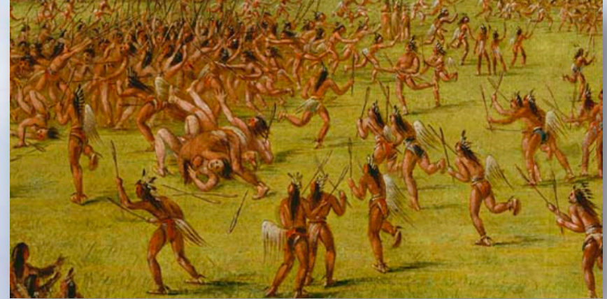
Ball Play of the Choctaws-Ball Up from an oil painting by George Catlin.