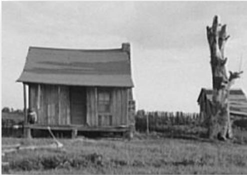
Sharecropper's Cabin, Washington County, Mississippi, 1937.

The Great Depression brought many economic problems to Mississippi in the 1930s. Farm prices were low and many factories, banks, and businesses closed.