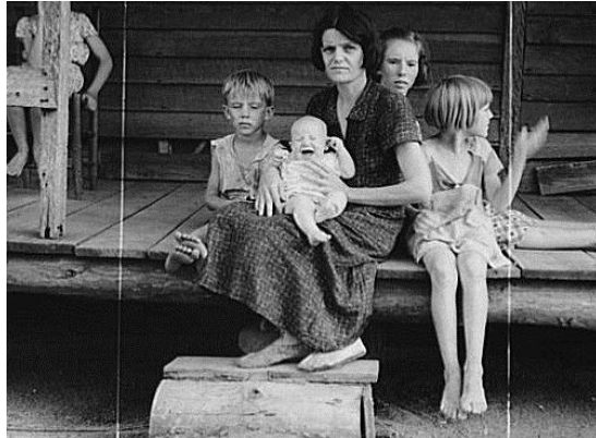
Cotton sharecropper family in Macon, County, GA, 1937.

Part I: Click here for Library of Congress: Great Depression Photos . Enter "Georgia" in the search box. Click the Gallery or Grid button. Click the next page arrow, as needed, to view pictures of our state during the Great Depression.