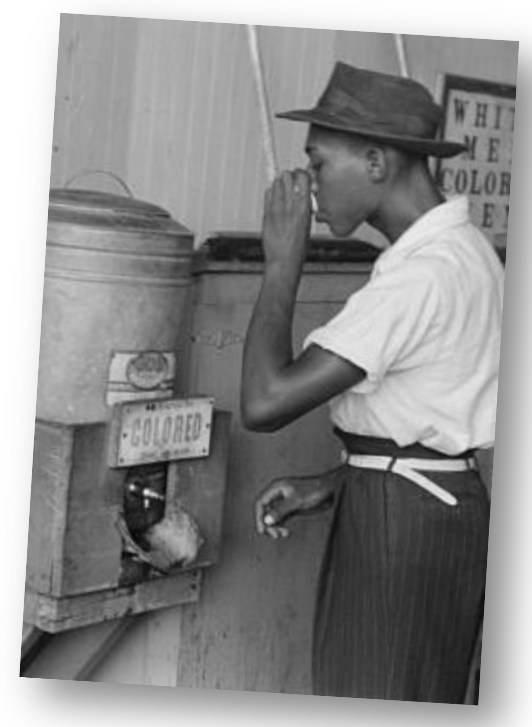
This photo was taken in 1939. It shows a young African-American drinking from a water cooler marked "Colored." Source: Library of Congress, Prints & Photographs Division. ID: fsa 8a26761