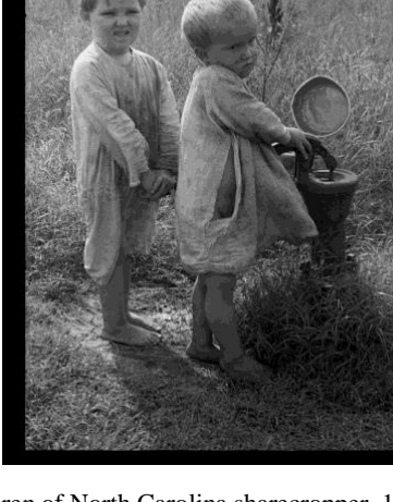
Children of North Carolina sharecropper, 1935.