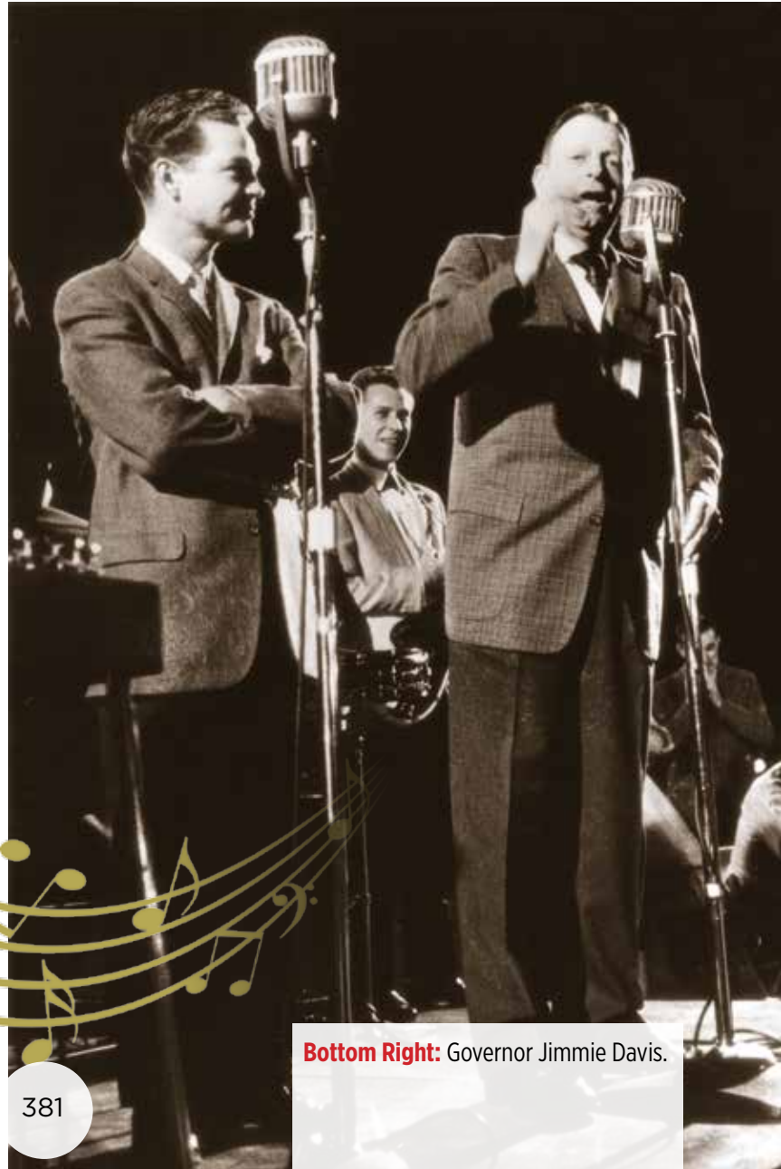
Bottom Right: Governor Jimmie Davis.

Jimmie Davis's most popular song was "You Are My Sunshine," which he first recorded in 1940. When he ran for governor in 1944, he used it as his campaign theme, singing it during speeches and at fundraisers, often while riding his horse named "Sunshine."