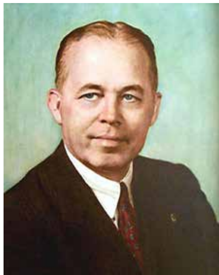
Right: Governor Sam Jones.

The election of Sam Jones to the state's highest office reflected that view. In fact, when Jones became governor in 1940, voters also sent a majority of anti-Long legislators into both the state Senate and House. Jones had promised voters that he would continue many of the popular programs of the Longs. These included supplying free schoolbooks and continuing the popular road and infrastructure projects of the Huey Long era. However, Jones also promised to provide those services without graft and corruption.