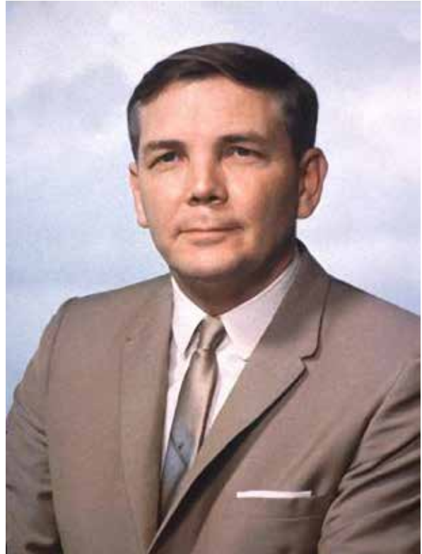
Above: Governor John J. McKeithen.

When John McKeithen left office at the beginning of 1972, the state had undergone a period of enormous change in a very short period of time. That change did not come without conflict, but McKeithen's leadership spared the people of Louisiana some of the violence that accompanied those same changes in Mississippi and Alabama.