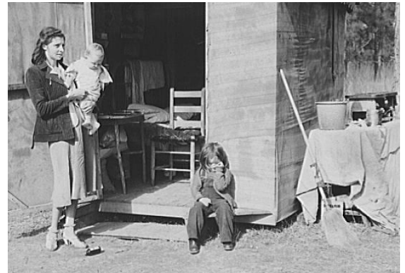
Family of construction worker, Monroe, LA, 1940.